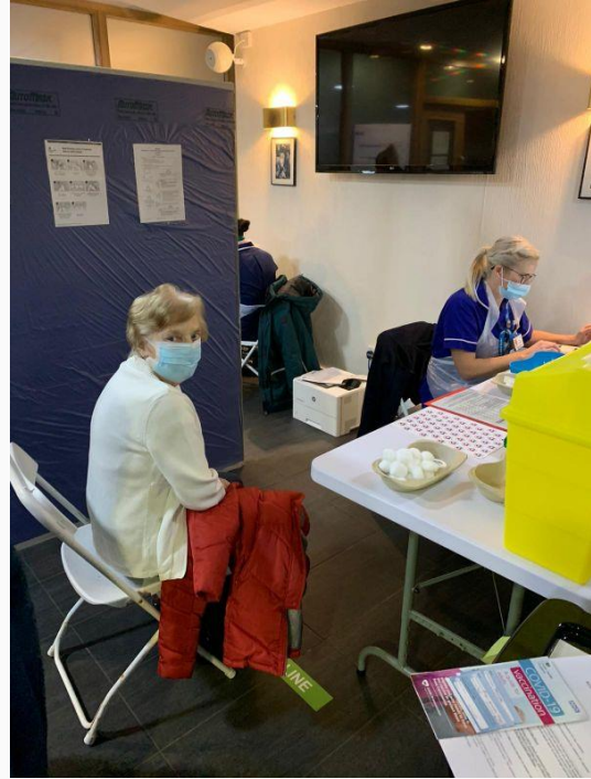
Over the weekend, a local Facebook page group received positive comments regarding the vaccination rollout in Swadlincote.