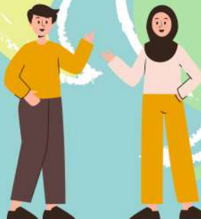
So many conversations and connections – relevant stalls – inspiration and personal stories