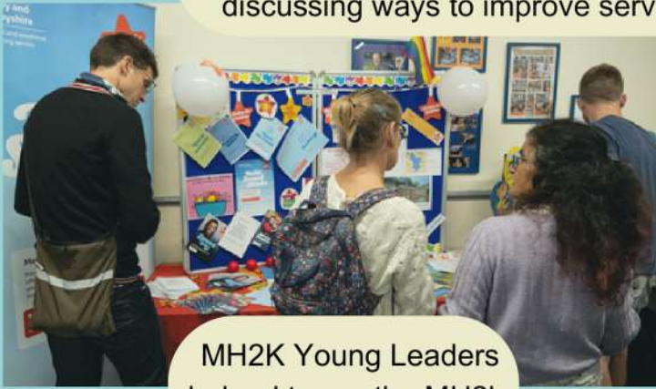
MH2K Young Leaders helped to run the MH2k stall on the day