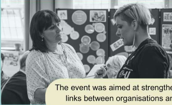
The event was aimed at strengthening links between organisations and discussing ways to improve services