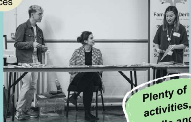
Plenty of activities, stalls and workshops